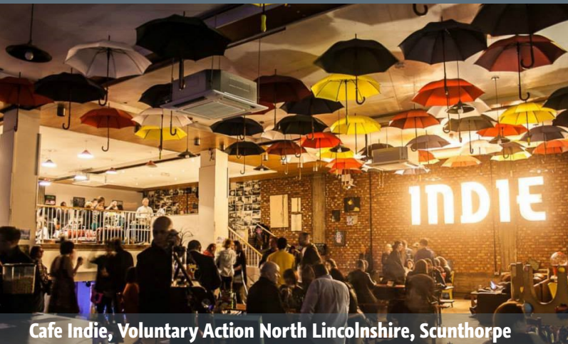
Cafe Indie, Voluntary Action North Lincolnshire, Scunthorpe

These are just a sample of the many inspiring and innovative projects that received backing when the Fund opened last year.