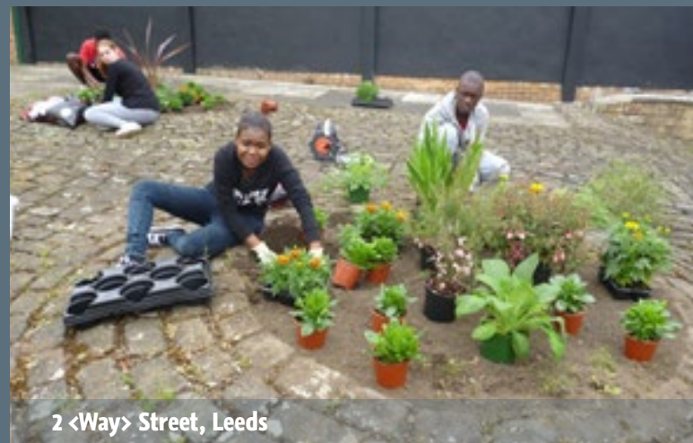
2 <Way> Street, Leeds

In recognition of its achievements to date offering an innovative use of procurement to secure significant efficiencies and convert savings into real money that can transform real lives, the Fund has been shortlisted for 2 prestigious national awards for Corporate Social Responsibility this year: the GO Excellence in Public Procurement Awards and the CIPS Supply Management Awards.