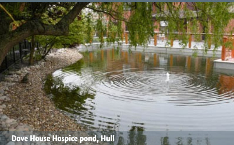
Dove House Hospice pond, Hull