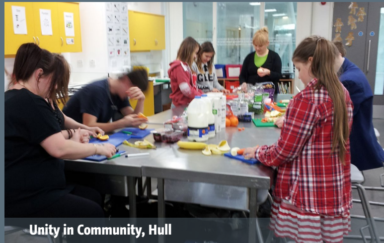
Unity in Community, Hull